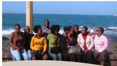
Participants in the Leadership, Innovation and Change Management Course in 2007

In order to achieve these priorities, it is the mandate of the LED Unit to promote and support the identification and generation of LED projects, to oversee the selection of projects, to ensure the disbursement of funds to municipalities, to assist municipalities and beneficiaries with project implementation, to monitor and evaluate the impact of these projects in the communities and to develop recommendations for further enhancement and improvement. The unit also has to ensure that there is a coordinated effort and will seek to leverage resources amongst key stakeholders where the delivery of LED initiatives is concerned. This is evidenced by the converging and coordinating efforts of the Department, Department of Local Government and Traditional Affairs (DLGTA), Department of Agriculture (DoA), the Office of the Premier (OTP) and the Provincial Treasury (PT) and the Thina Sinako Provincial LED programme. To ensure that those managing and delivering LED have the necessary skills, the unit organises in-house training from accredited institutions. 30 LED practitioners were trained on the fundamentals of LED and Managing Change and Innovation during 2007/08 financial year.