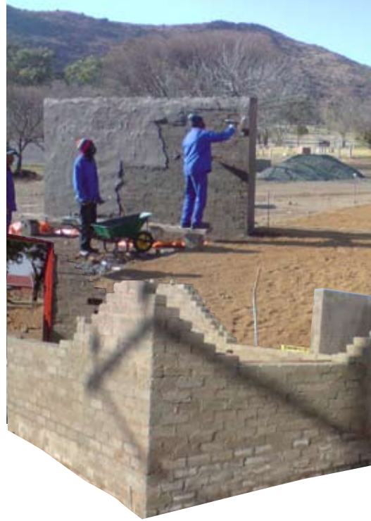
Construction of Chalets at J.L. De Bruin Dam