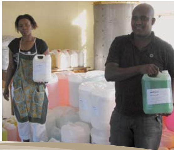
Chemicals produced at the Cistrans project site.

The project has created eight employment opportunities for four young males and four young females. Their core business is to produce household chemicals and industrial products like wax polish and cleaning liquids. It is located in Zimbane A/A, King Sabata Dalindyebo Local Municipality. The funds allocated to the project were R150 000 in the 2006/07 financial year.