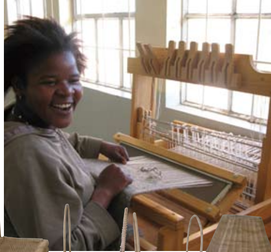
Picture of one of the beneficiaries at Efata and the Sakhingomso Project wares.

The project is located in the EFATA area in King Sabata Dalindyebo Local Municipality. The beneficiaries of the project are all disabled young people. It was allocated a budget of R150 000 in the 2006/07 financial year and it has managed to create 12 jobs in the following categories: four men and one woman in the cane weaving hive, two men and a woman in mohair weaving, and four men in the welding hive.